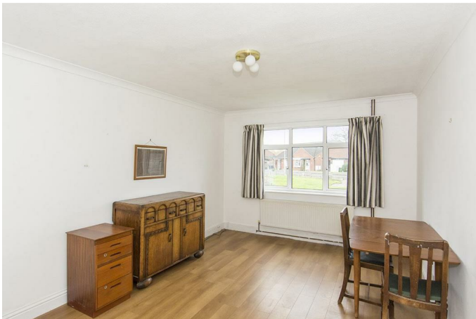
UPVC double-glazed window to front. Radiator.