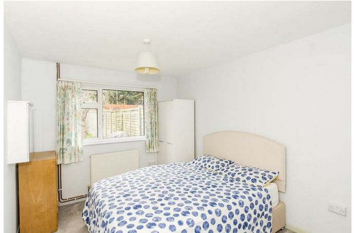
UPVC double-glazed window to rear. Fitted wardrobe. Radiator.